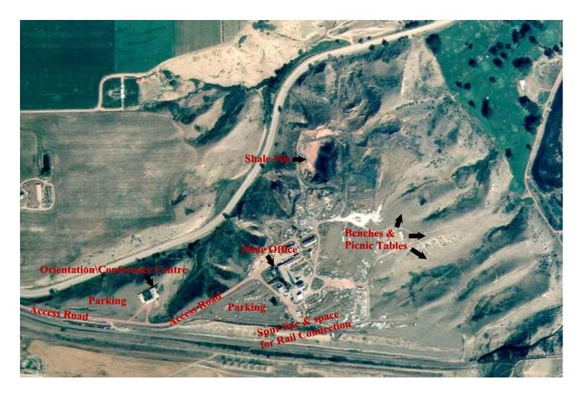
Aerial View of Site and Proposed Development

The Galt #8 Mine Historic Site Society is negotiating with the present property owners to purchase the property and to develop an historical interpretive centre that will preserve and enhance existing mine buildings. Our Society hopes to develop the site as a centennial legacy project that will celebrate our mining heritage and provide both an educational and virtual reality experience to the visitor. The existing property will be developed to allow the public controlled access to the park for a variety of community uses that will not interfere with the integrity of the site.