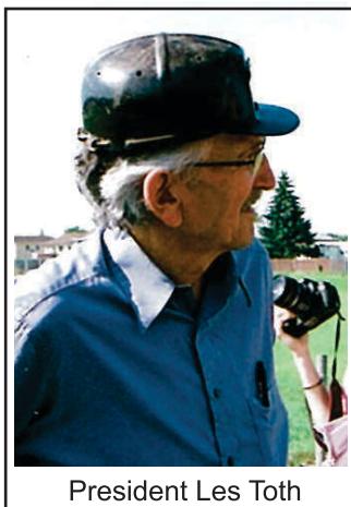
President Les Toth

The greatest lesson that human beings can learn from nature is the lesson of sowing and reaping: Sowing seeds into good soil followed by a productive growing season, and concluding the process with a bountiful harvest.