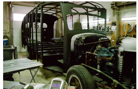
Front photo of Miners Bus with Bus Body Frame reassembled on chassis & freshly painted. Dec 13/11